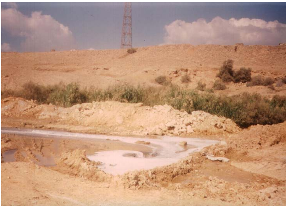
Some photos showing land slide activity